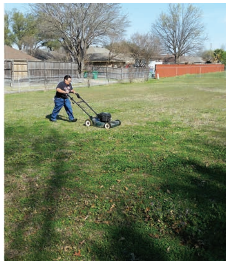
We can do this the hard way...