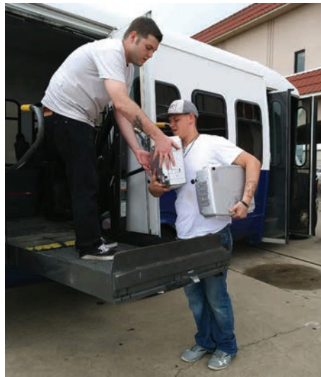
The multi-media team arrives...

I'm sure you're wondering: 'How are your investments distributed'? We often find ourselves determined to reach out (Service Above Self) and help someone who is desperate for help. When we fail to see improvement right away, our resolve can weaken. The Apostle Paul urges us to be patient in helping one another through the stumbles and struggles of life. Paul writes 'Carry each other's burdens and so fulfill the law of Christ' (6:2) - a comparison to the task