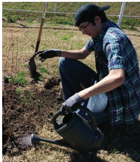
One plants, one waters...

Seats Are Limited! All Tickets Must Be Purchased In Advance! No Tickets Sold At The Door! All Dinner Lines Open at 6:30 P.M.