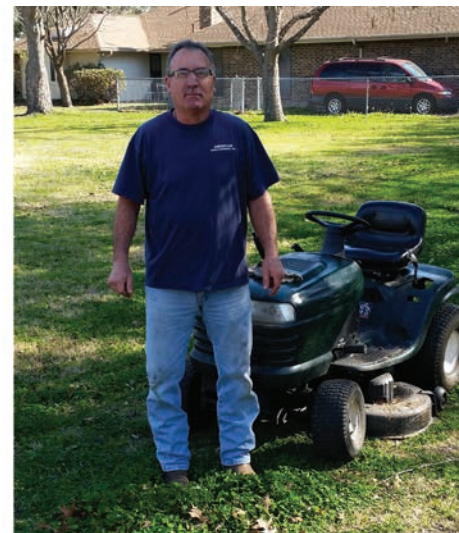
...or the easy way.